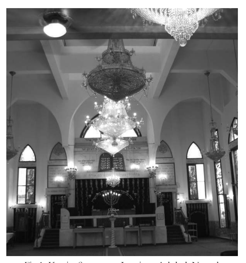
Fig 1: Karaite Synagogue Interior - Ashdod. Note the absence of chairs or benches. This feature is typical of practically all Karaite synagogues in all countries of the world; a few chairs for the elderly may be found at the entrance in the area called moshav zeqeinim .

<sup>13</sup> The biblical prohibition of aunt-nephew relations is found in Leviticus 18:12-13; 20:19; for a positive rabbinic statement about uncle-niece marriage, see B. Yevamot 62b.