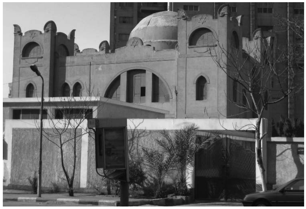
Fig 3: Karaite Synagogue Exterior - Cairo. The Musa Dari Karaite synagogue in the center of Cairo is named after the most famous medieval Karaite poet, Musa Dari. At the moment it is forsaken by the community and is in the hands of Egyptian authorities; until recently there was a small library with Karaite books, photos, and manuscripts in the small building in front of the synagogue.