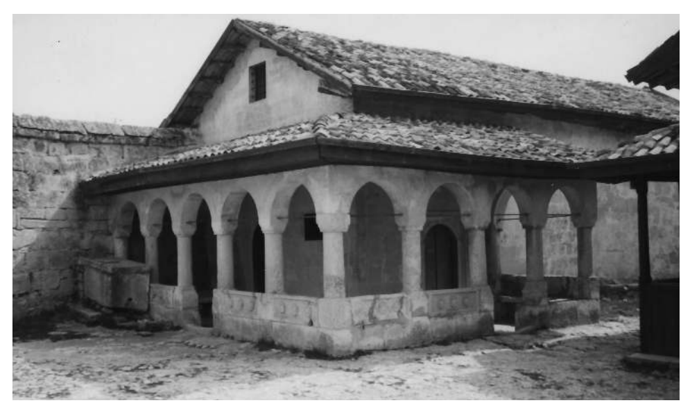
Fig 4: Karaite Kenassa - Chufut Kale (Crimea). Eastern European Karaites, who speak a Turkic dialect, called their synagogues "kenassa," a word of mixed Semitic origin (similar to the Hebrew beit keneset ). The mountainous fortress of Chufut Kale was the main seat of the Crimean Karaites until the mid-nineteenth century. Note the unusual Oriental design of the building.