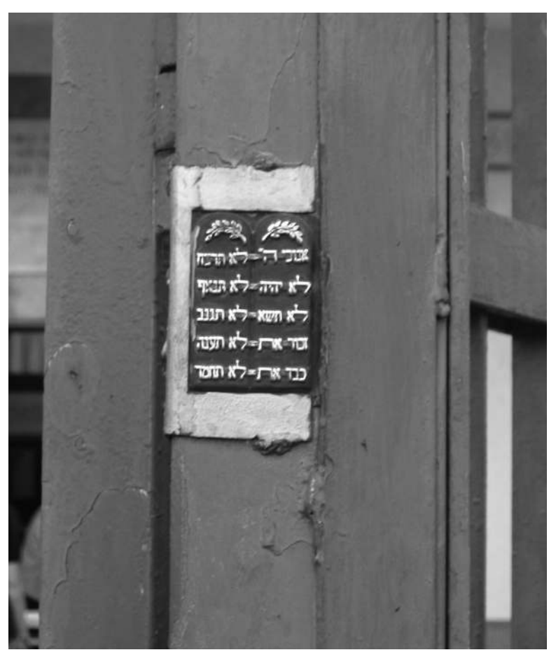
Fig 2: Mezuzah - Ashdod Synagogue. A Karaite "mezuzah" placed at the gate leading to the entrance to the Ashdod synagogue. Karaite "mezuzot" are usually metal symbolic images of the Tablets of Law—and not parchments with biblical passages (Deut 6:4-9, 11:13-21) used by the Rabbanites. Karaites normally treat their mezuzot as Rabbanites treat theirs, e.g., kissing them upon entering a building.