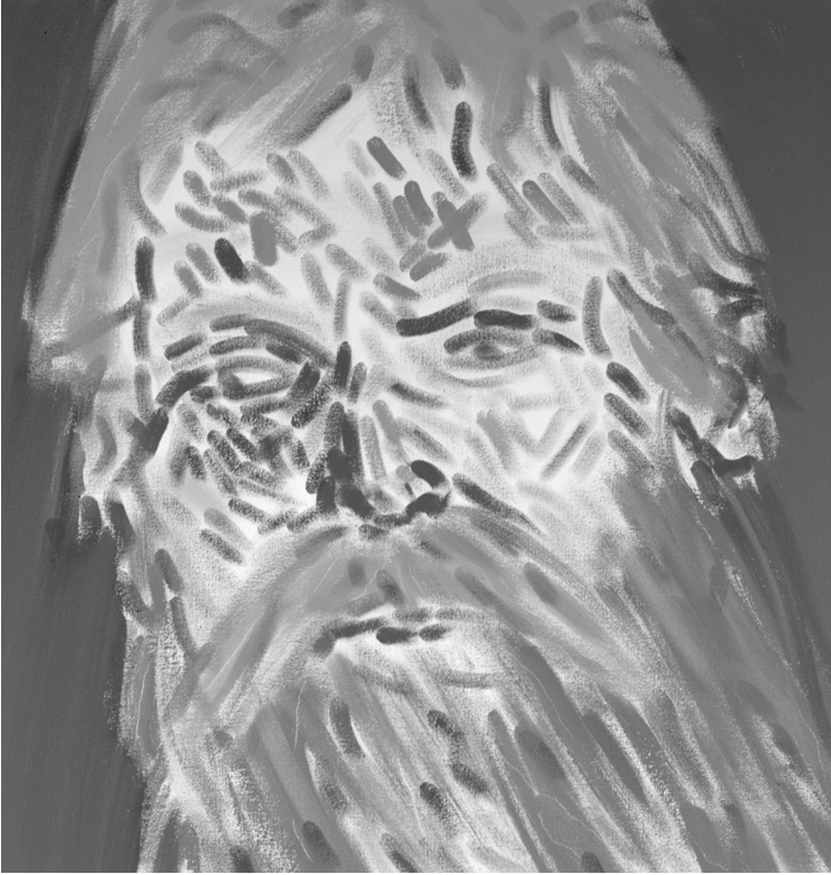
Kitaj, Servant of Abraham , 2004, oil on canvas