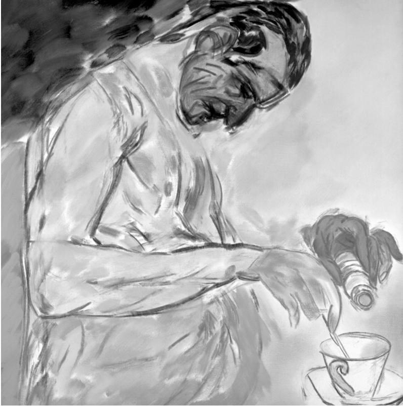
Kitaj, The Jew Etc. Etc. , 1989-2004, oil on canvas