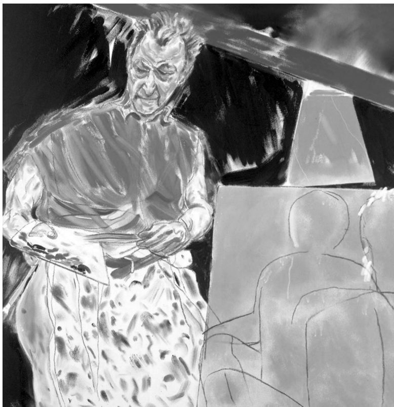
Kitaj, Freud Paints Me Twice , 2004, oil on canvas