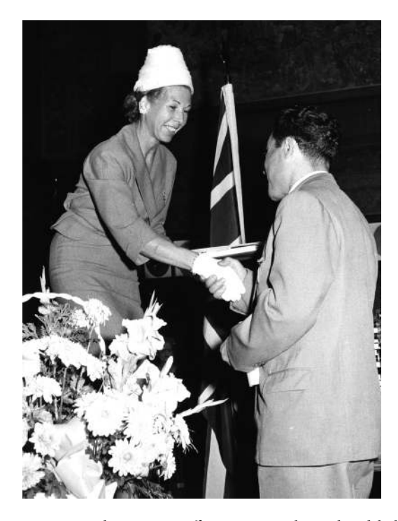
An IODE volunteer assisting the Institute offers a congratulatory handshake and a picture book on Canada to a new citizen during a citizenship reception at Toronto City Hall in May 1959.