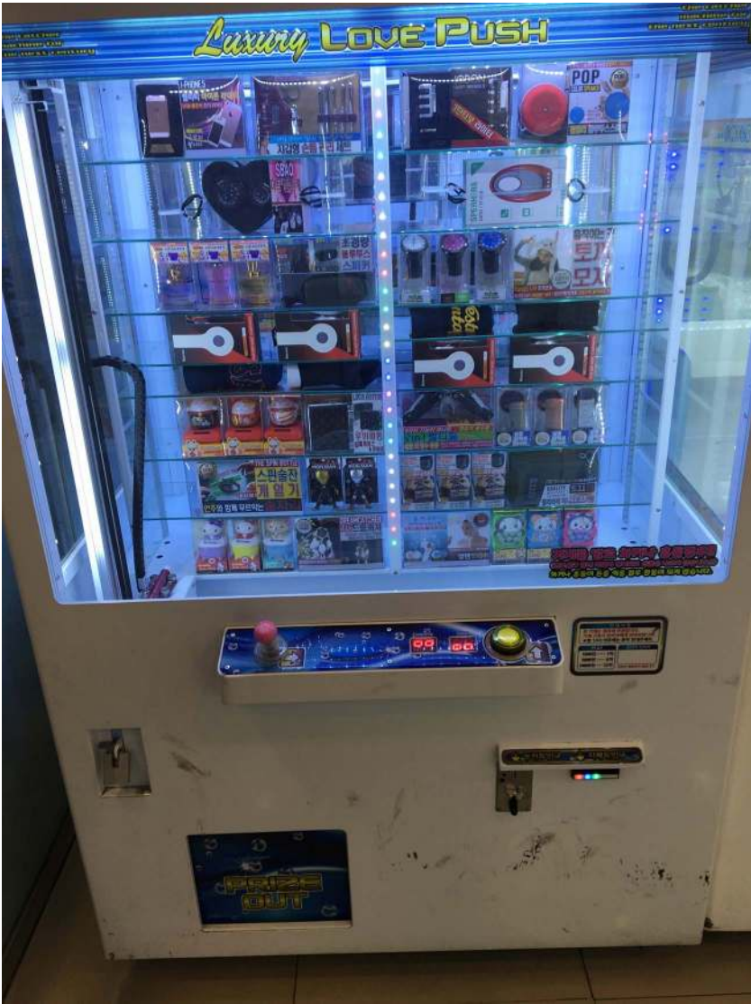
Fig. 6. A toy crane in Daerim (Seoul).

game is supposed to be played for “love.” The term “luxury,” in turn, communicates a higher-stake gambling element: this is one of the more expensive cranes (1000 won), but victory will be rewarded with a more expensive prize, too. On the other hand—despite offering the usual pool of various toys—most of this machine’s prizes (pocketknives,