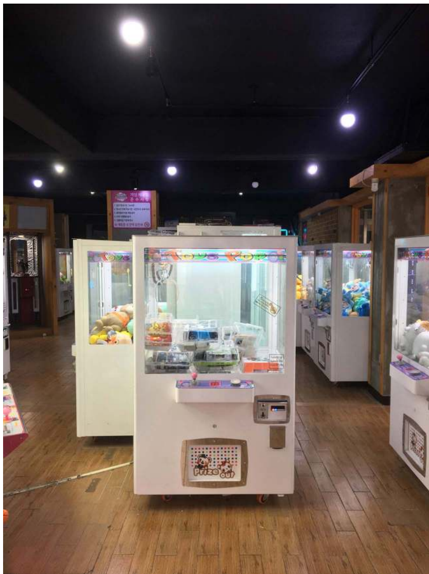
Fig. 5. Ppopkibang in Sinchon (Seoul).

driven “cute” design (the cabin is transparent from all sides in contrast to the usual single-screen arcade games).