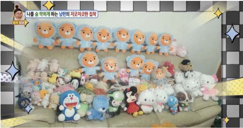
Fig. 8. The husband's toy crane price collection from Hello Counselor (2016).

offering ego-boosting and satisfaction in a life situation where career opportunities are difficult to pursue.