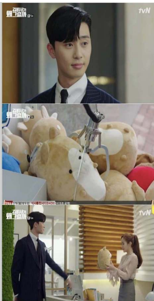
Fig. 9. Scenes from Korean TV drama What's Wrong with Secretary Kim (2018).

crane. The date is presented as the vice-chairman's first doll drawing session ever; he fails, yet gets fixated on the machine and keeps on playing alone. On the following day, he finally wins a doll and goes to hand it to Secretary Kim as a gift. This, again, exemplifies the toy crane's function in courtship play; and indeed, the crane works as "analogue peacocking" now in a mix of curation, transmedia consumption, and gendered romantic role-play.