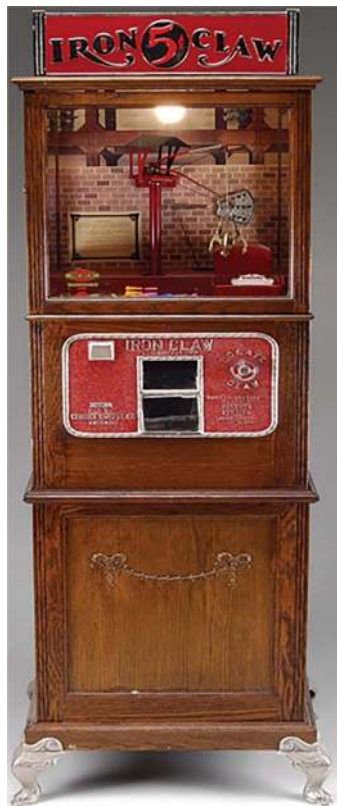
Fig. 2. The Iron Claw (1928). Pinball Repair.

The U.S. court, in the decisions it has approved, has ruled that three elements are necessary for machines to be considered as gambling devices—(1) risk of something of value (consideration), (2) a prize, and (3) chance, a risk of loss or winning. There is no question but that two of the foregoing three requisites of a gambling device are present in each illustration presented by you. The important matter of inquiry therefore revolves about determination of the presence or