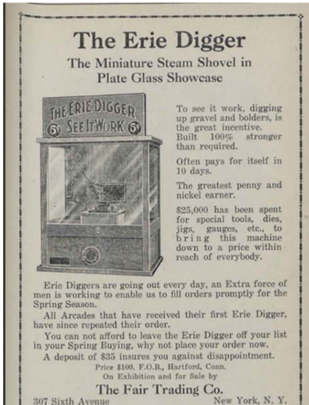
Fig. 1. The Erie Digger. Year unknown.

first digger game went into action in the 1920s at the Coney Island amusement park in New York, the “No. 1 test spot for coin-operated gadgets.”