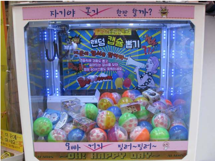
Fig. 4. A toy crane in Gwangbok-dong (Busan).

entertain the possibility that, especially during times of uncertainty, the “ego-boosting” effect is enhanced by this “catching the losses,” which the toy crane is designed to provide. After failed drawing attempts, players can liquidate their regret by retrieving fortune in exchange for an extra coin. These positive narratives are further intensified in media representations, as discussed below.