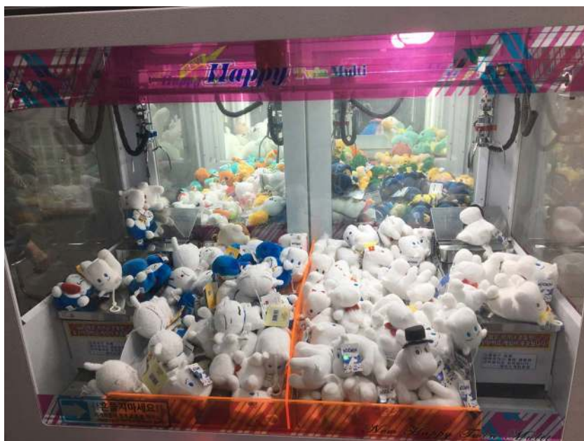
Fig. 7. A toy crane in Dongdaemun (Seoul).

desired—live-streamed via Afreeca TV—in the mix of numerous subcultural trends and an emphasized metaphor for the laypeople's struggle to confront contemporary hopelessness and eliminate regret. As toy crane playing is described in terms of the man's caring for his family and the neighborhood, the novel highlights masculine intergenerational play.