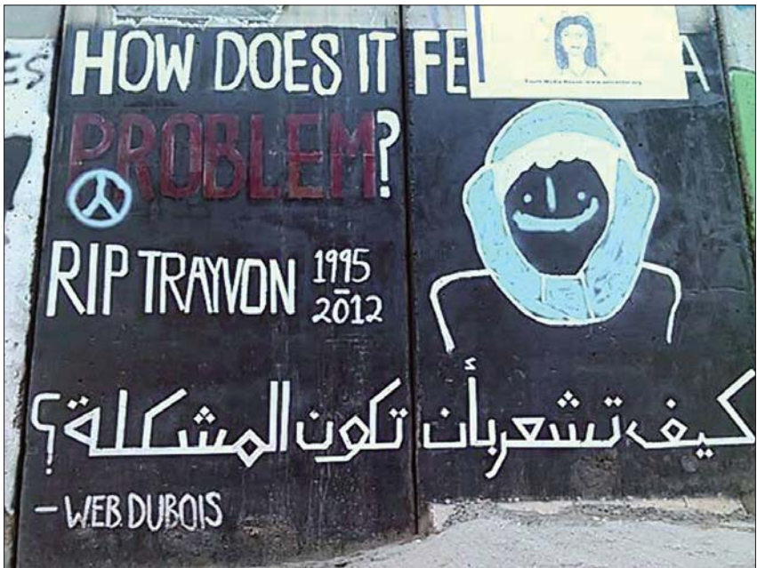
Living reciprocal solidarity: Figure 2, top, photo © copyright and used by courtesy of the photographer, Hamde Abu Rahme; Figure 3, bottom, photo © copyright and used by courtesy of the photographer, Amira Dasouqi.