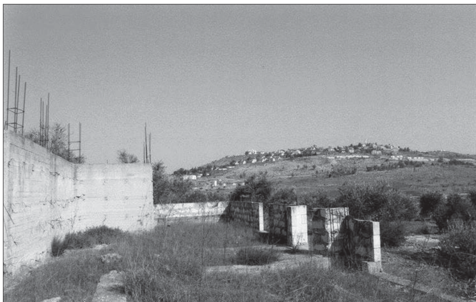
The destroyed foundation of what was to be my family home in Turmosayya, Palestine, with Shiloh settlement in the background (35 mm, B&W photograph by the author).