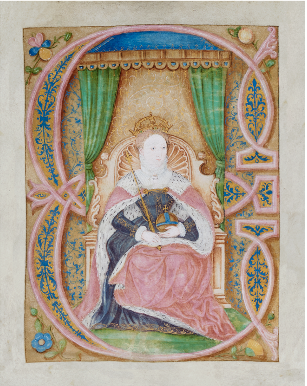
Figure 17.2. Detail from illuminated charter of "Inspeximus," Elizabeth I, DR10/803, © Shakespeare Birthplace Trust. Courtesy of Shakespeare Birthplace Trust.