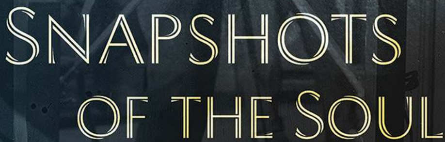
Photo-Poetic Encounters in Modern Russian Culture