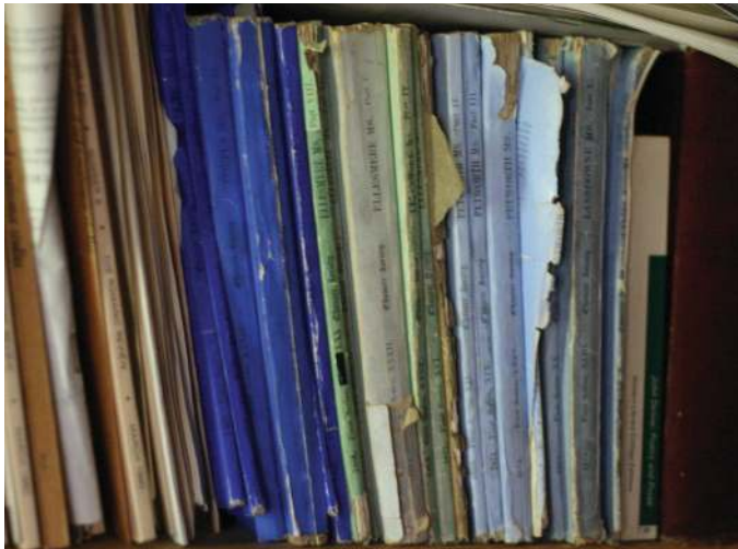
Figure 6. Chaucer Soc. Publ. on my shelves.