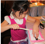
GT: letter opener