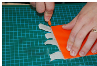
GT: letter opener