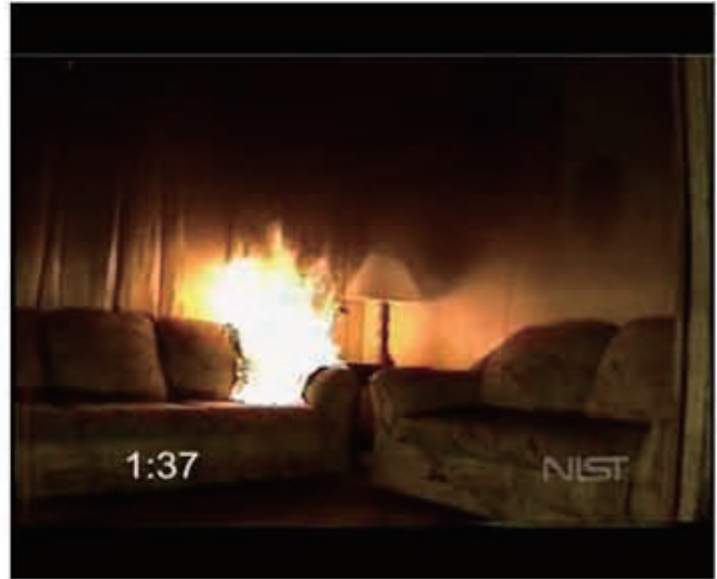
(b) Current frame