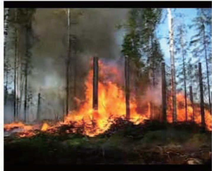
(d) Current frame