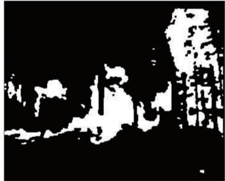
(e) Binary mask of high intensity region