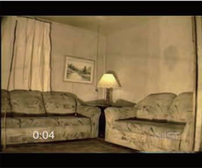
(a) Background modeling